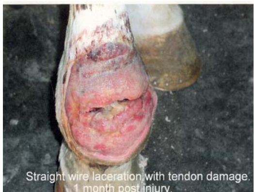
Straight wire laceration with tendon damage. 1 month post injury.