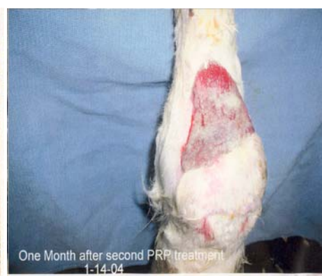
One Month after second PRP treatment 1-14-04

Want to see these pictures in color? Check our web site www.bchmt.org