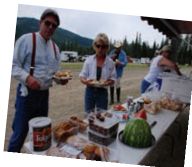
Food being served