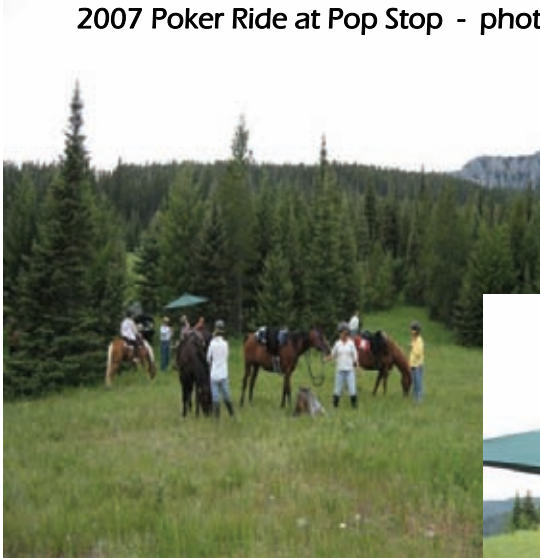
2007 Poker Ride at Pop Stop

There will be a consultation and horse analysis at 1pm. To reserve your consultation contact Duane or Jan Wiltse 586-3597 or duanewiltse@yahoo.com .