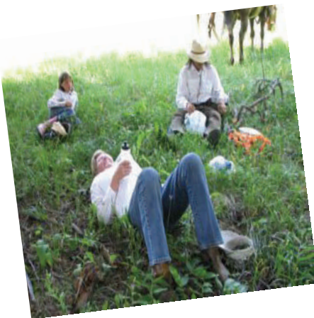
Pre ride photos by Janice

On our pre-ride, we surprised 2 sleeping owls in a tree branch only a few feet over our heads. The one owl dropped down 5 or 6 feet and then flew up and away right next to us. The second owl actually hit the ground right at our feet and then managed to get airborne. Not sure who was more surprised, the owls or us BUT none of the horses even flinched!