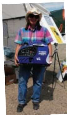
Top winner of the generator