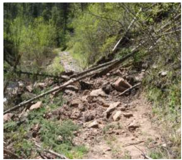
Trail closed somewhere