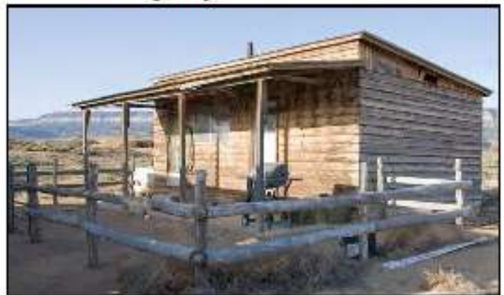
Cowboy cabin provided shelter from the wind.