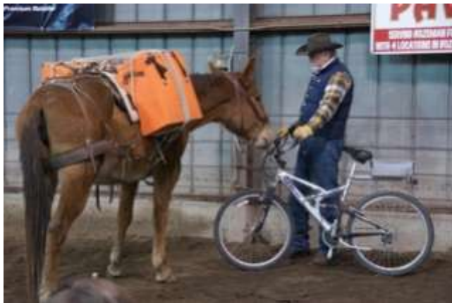
Mountain mule meets mountain bike!