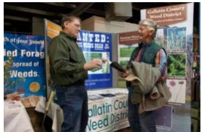
Gallatin Valley Weed District Display