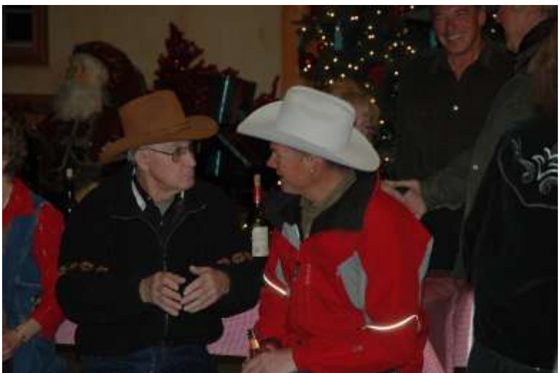
More pictures are available on the web site.