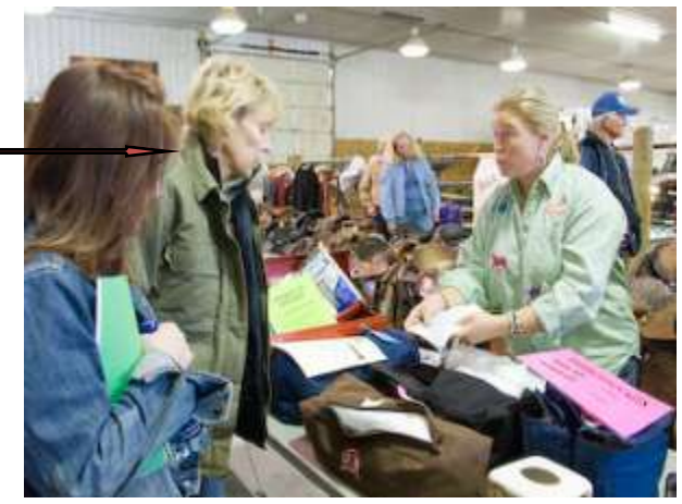
about all of the good information and help available in controlling noxious weeds in our area and out on the trails, Continued.....