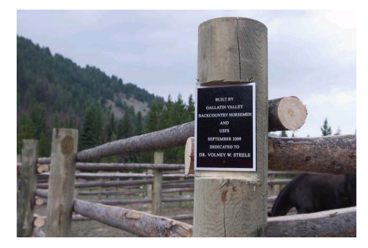
The commemorative sign was mounted on the south east corner of the corrals to overlook the Spanish Peaks

It's a wrap! Dan Marsh wraps an electrical cord as the project is completed.