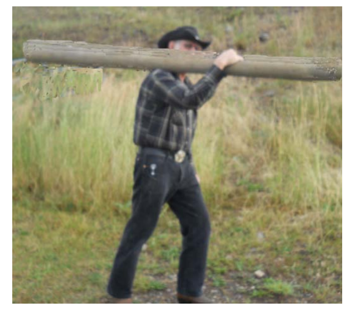
Corral work: toting the posts

This has been a busy month! . This past week end, (Aug. 27th & 28), I and a bunch of dedicated members build four of the nicest corrals at Spanish Creek Campground. Many thanks, to all the members who showed up and worked very hard to get the job done in one day. The project started at 8 am in the morning and was finished by 5:30 that very same afternoon. GOOD JOB , fellow members!