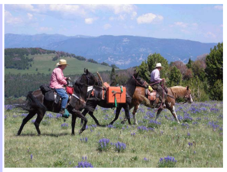
Bonnie Hammer and Rich Inman enjoy sunny skies and lupine-scented meadow; later there were thunder showers