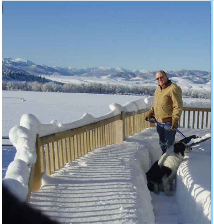
HERE IS Hope: Winter is over