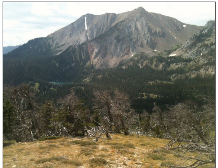
Sacajawea peak and Fairy Lake from Shaft house