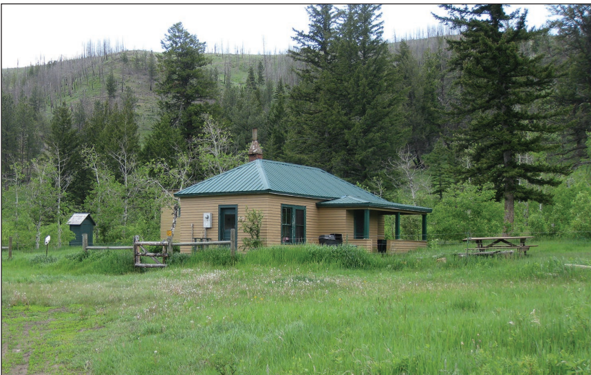
West Bridger Creek Forest Service Cabin & Derby Fire (2006)