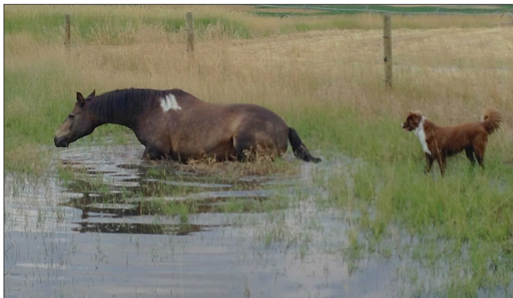
Moose's "swimming hole"

Registration forms are online at www.gallepmt.org .