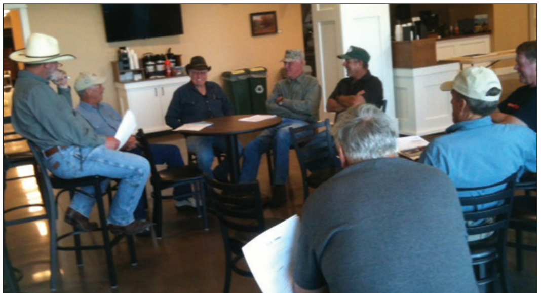
GV BCH Board members at work