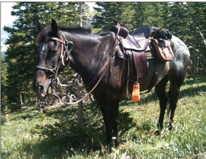
Tacked Appy on Shafthouse Mountain