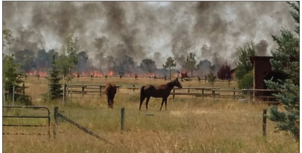
field fire on Nelson Road with a worker's car with a catalytic converter being the igniter