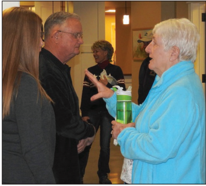
Wild Game Feed Potluck